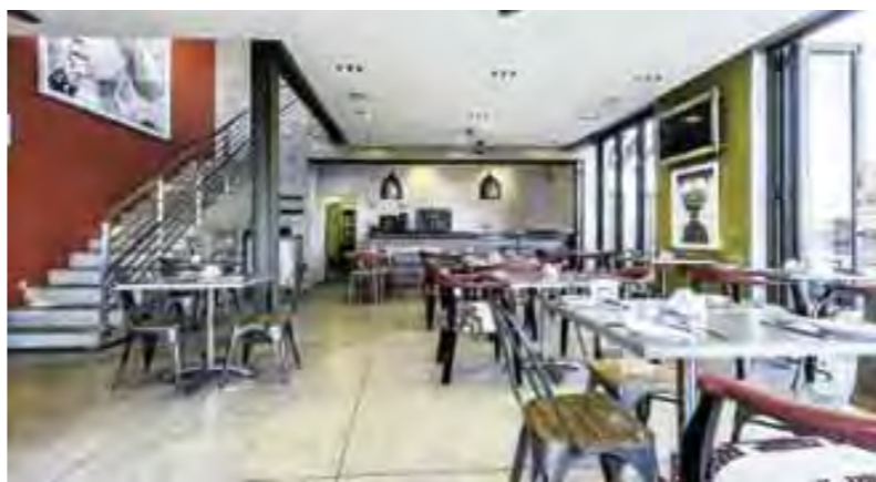
WAITING TABLES: Vuyo's restaurant in Vilakazi Street, Soweto

The local success stories that exist today are those of pioneers who are setting a good example for the next generations.